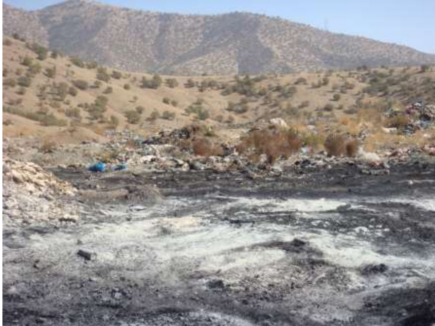
Figure 5: Burning Trash in The Zagros forest (Marivan region).

Waste burning in forest leads to deforestation and environmental pollution.