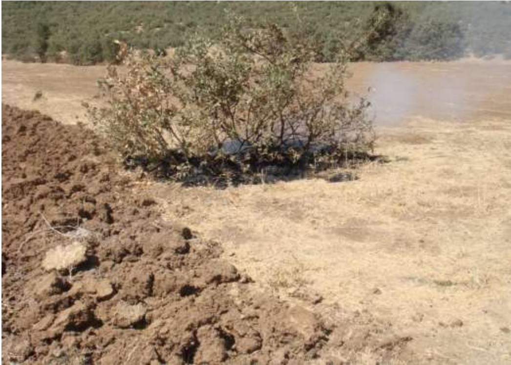
Figure 2: fire, grazing and farm operation condition in The Zagros forest (Marivan region).

The major element of Zagros forest destruction include: fire, grazing, farm operation in forest, fuel wood and timber, mining, semi-parasite plant and non-wood forest production