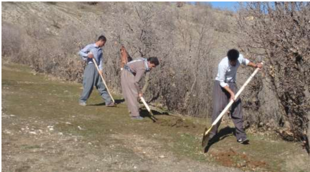
Figure 7: the view of the reforestation in the Zagros climate change project