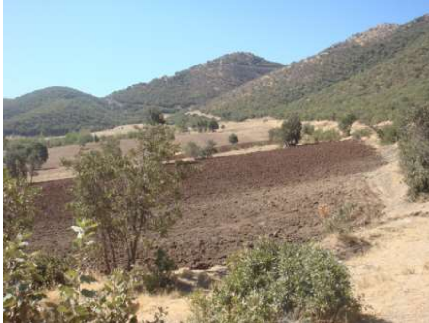
Figure 4: farm operation condition in The Zagros forest (Marivan region).

Most of soil physical, chemical, mineral and biological attributes are changed by forest fires. Fire is one of the most important factors of forests destruction in Marivan region and considerable area of the region are annually exposed to fire. Depend on environmental conditions and also fire intensity, different effects will impose on ecological conditions of the environment (Hemmatboland et al , 2010).