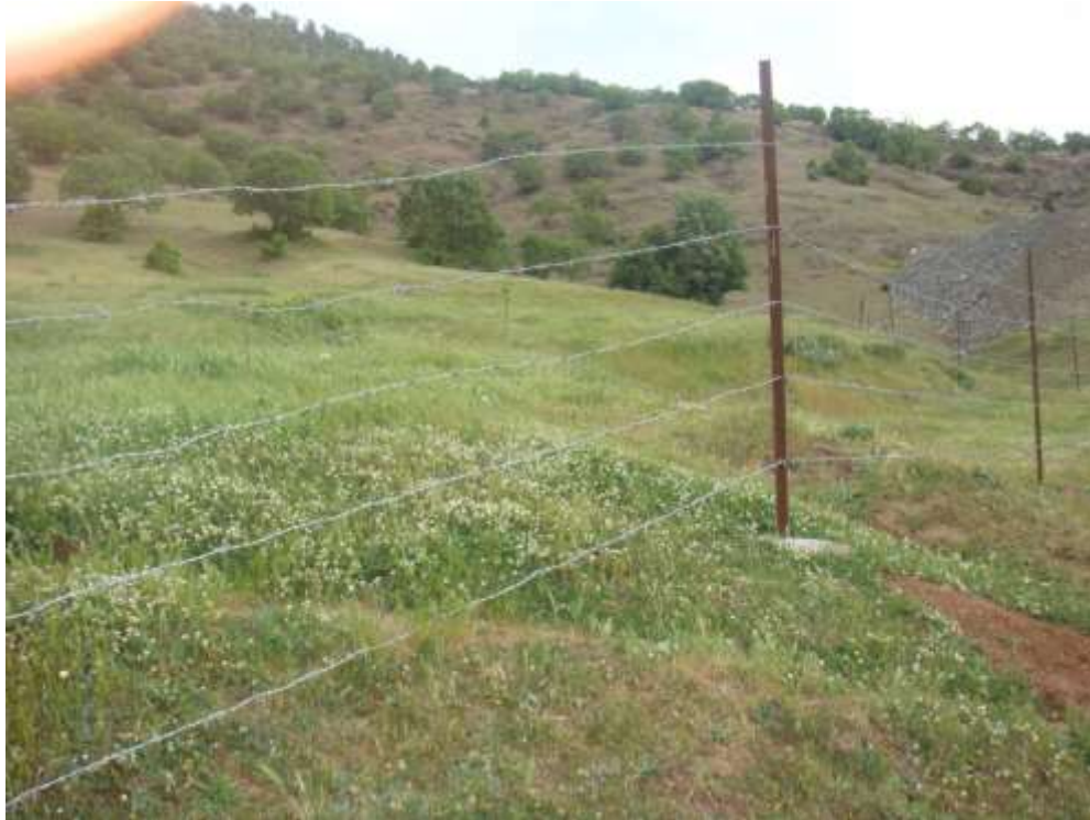
Figure 13: the view fence used for protection of plantation in this project

For protection this plantation from livestock and human distract used the fence (figure 13)