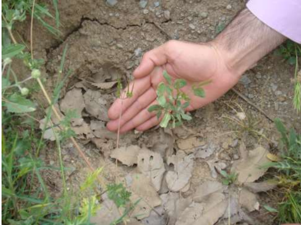
Figure 9: the view of the plantation by used the Pistacia atlantica Desf in the Zagros climate change project