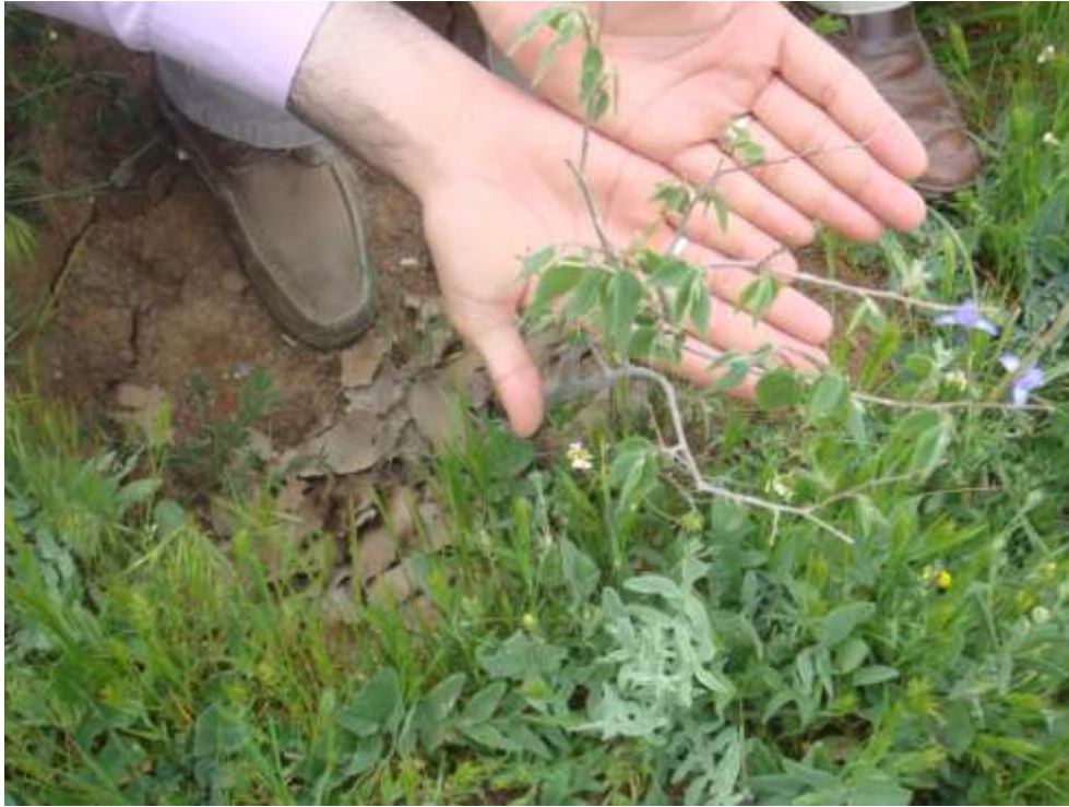
Figure 11: the view of the plantation by used the Romex sp. in the Zagros climate change project