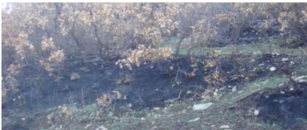
Figure 3: fire condition in The Zagros forest (Marivan region).