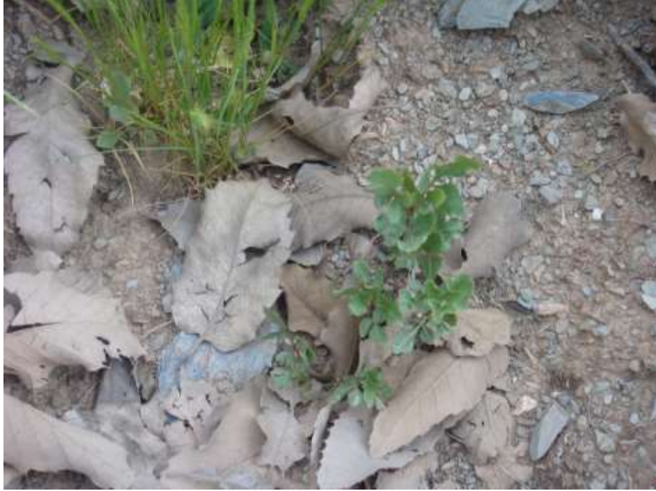
Figure 8: the view of the plantation by used the Quercus spp in the Zagros climate change project

The most tree and shrub species used for plantation in the project area (Jashniabad village territory) are Quercus spp., Pistacia atlantica Desf, Amygdalus communis L, Cercis griffithii Boiss, Celtis tournefortii Lam, Romex sp. and Juglans regia L.