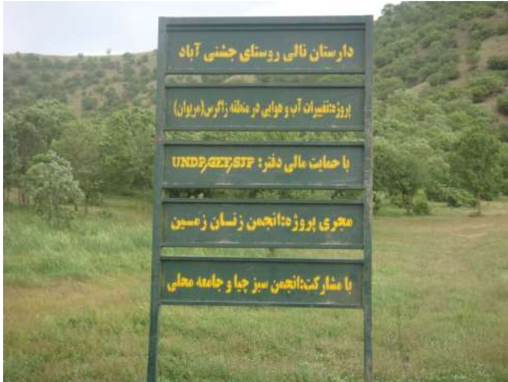
Figure 6: the location of Climate change projects in the Jashniabad village (Marivan region)